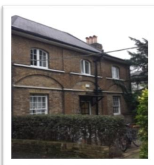
Longley House & Lower Cottage

Located on the corner of Queen's Road and Marlborough Road. Uniquely, it is split into flats, each with their own kitchen. The majority of rooms are shared and it is our main self-catered accommodation.